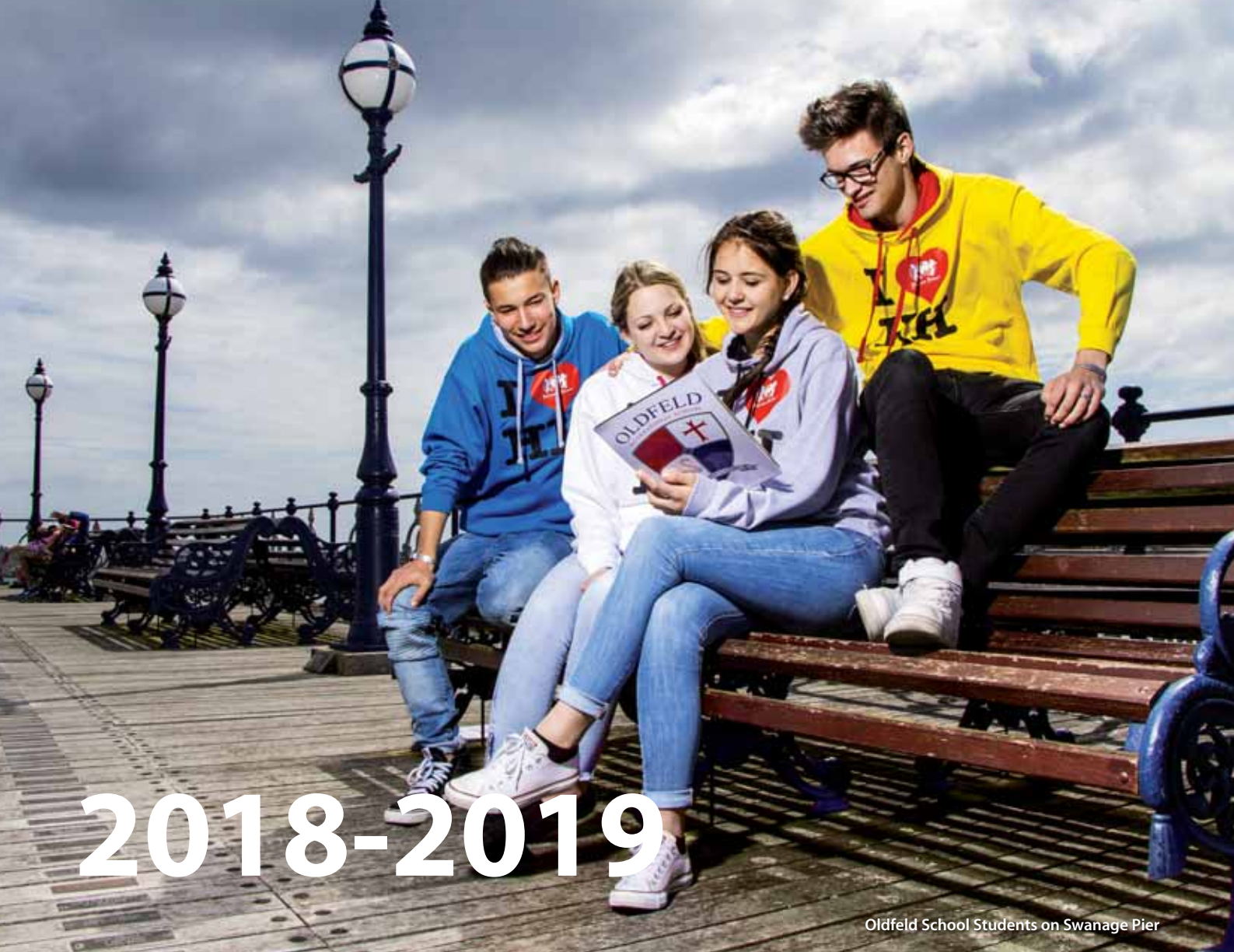
Oldfeld School Students on Swanage Pier