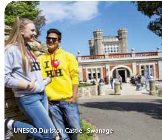
UNESCO Durlston Castle - Swanage

Harrow House is a Tier 4 Sponsor of the Points Based System (license number ATU625RNO).