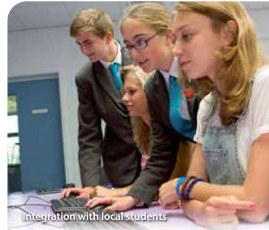
Integration with local students