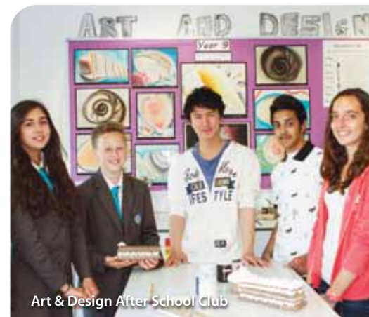
Art & Design After School Club